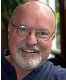
Keynote Speaker Richard Rohr, OFM

twentieth century. The author of dozens of books, journals, and published correspondence, his legacy and influence continues fifty years after his death on December 10, 1968.